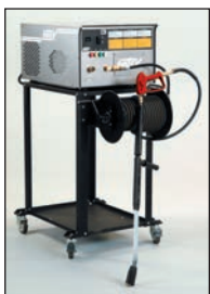
Optional Hose Reel Kit, Cart, Caster Wheel Kit and stainless steel base and cover

The most common accessories are telescoping wands, pivot and non-pivot hose reels, flat surface cleaners and high pressure turbo nozzles.