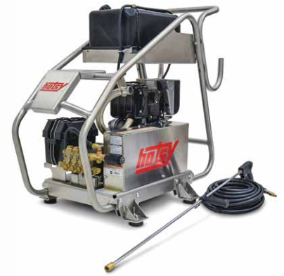
Diesel Model HHD 3.4/30 D with stainless steel frame

50-ft. high-pressure hose for easy maneuverability around a large working area