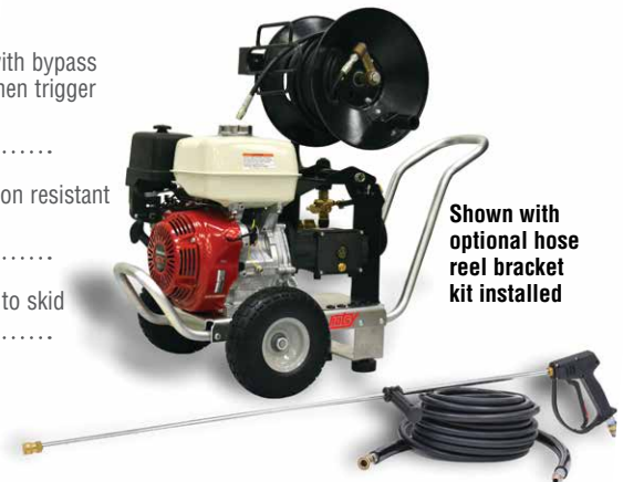
Shown with optional hose reel bracket kit installed